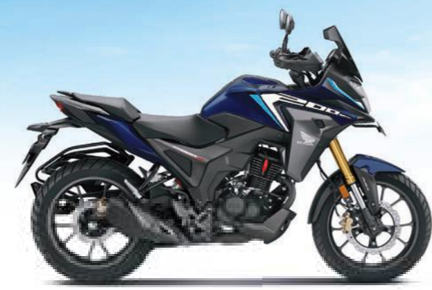
DECENT BLUE METALLIC